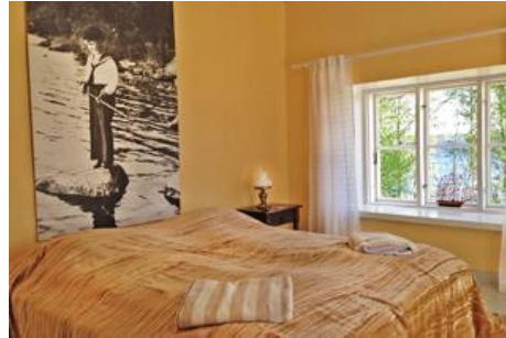
Miller's Cottage and Chamber make you think of corn fields, the sun and blue skies. These two rooms can accommodate a family of four or five, or a group of friends. Children bed also available. 175 €/day.