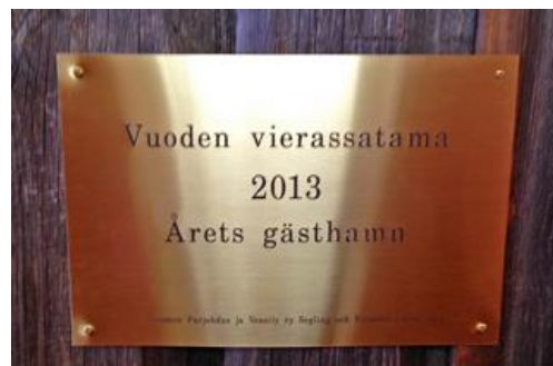
The best guest harbour in Finland 2013.