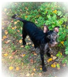
The doggie host Oliver welcomes all animals to Paksuniemi

Tel. +358 40 6838748 e-mail: paksuniemi@gmail.com http://www.paksuniemi.com