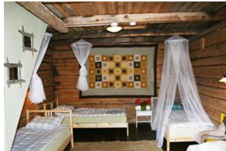
Aukusti's Cabin and Hanna's Room offer an exotic accommodation alternative to the adventurous minds for a lower price. 30 €/day per person with Your own bed linen 45 €/day with our bed linen and breakfast.