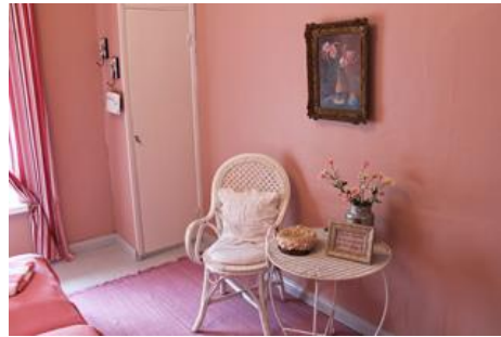
In Hilja the Milk Maid's Room you can be in a dreamy romantic mood in delicate rose colour. 105 €/day.